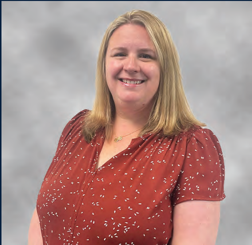
Jennie Marshall Relationship-based Care Award