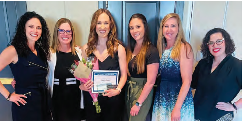
Above: Celebrating Nursing Excellence Awards