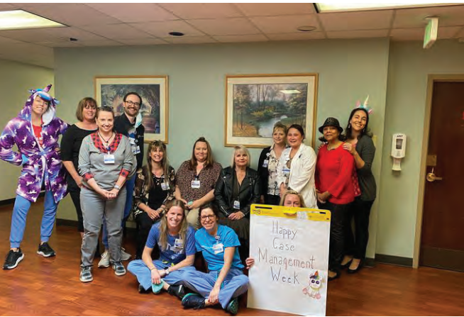
Above: Case Managers at Rose