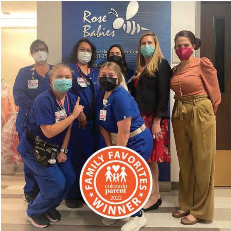
Above: Rose Women’s Hospital is a Family Favorite