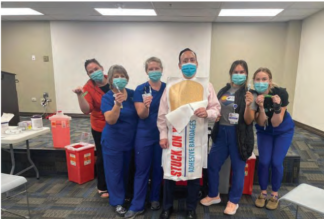
Above: Employee Health at Rose