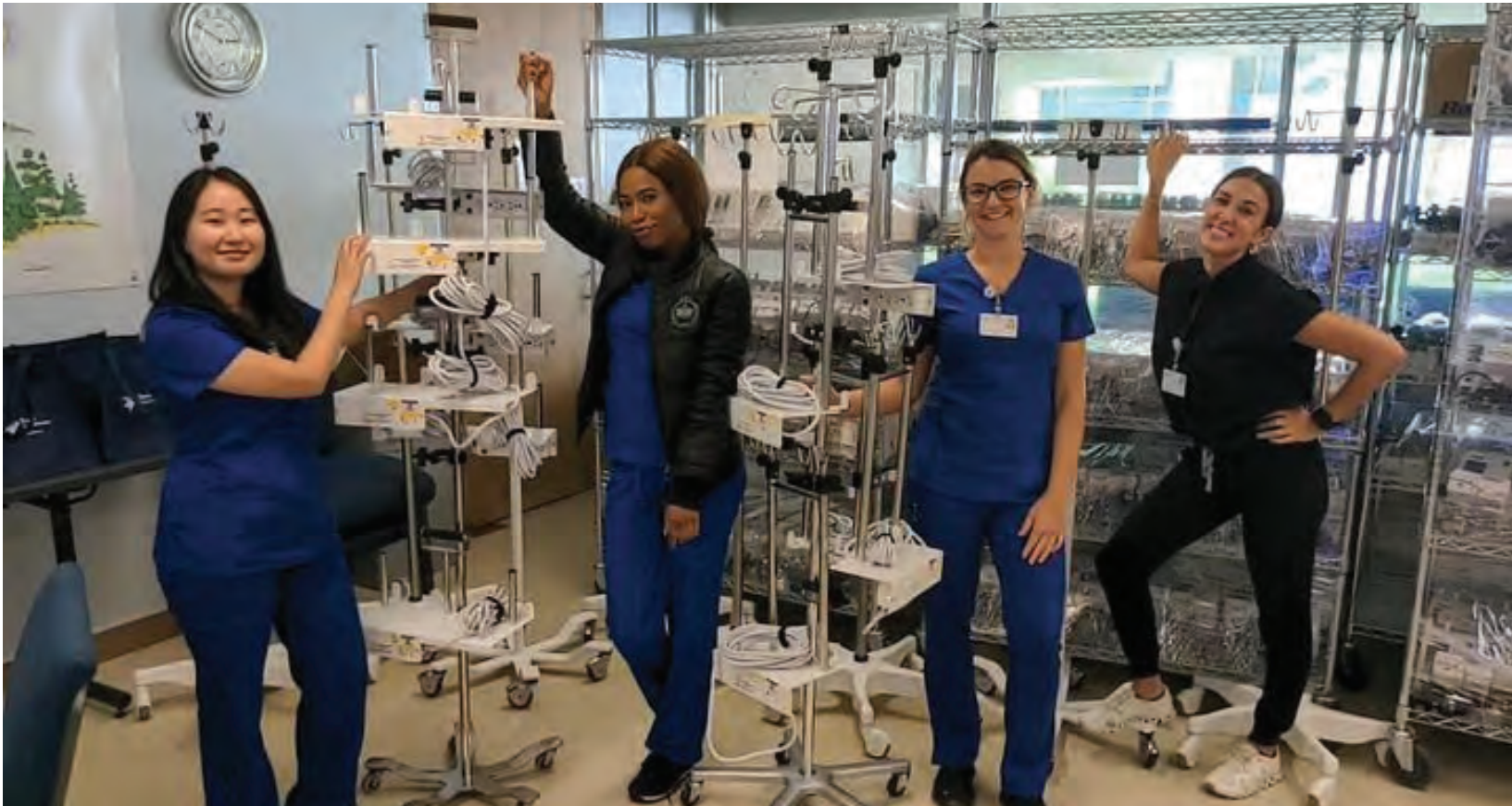
Below: 4 Central StaRNs