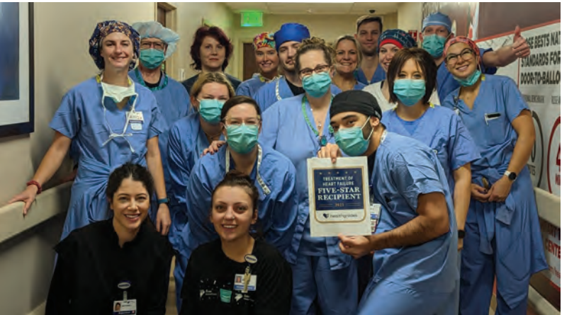
Above: Cath Lab Team Celebrates