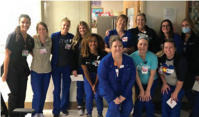
Above: NICU Nurses