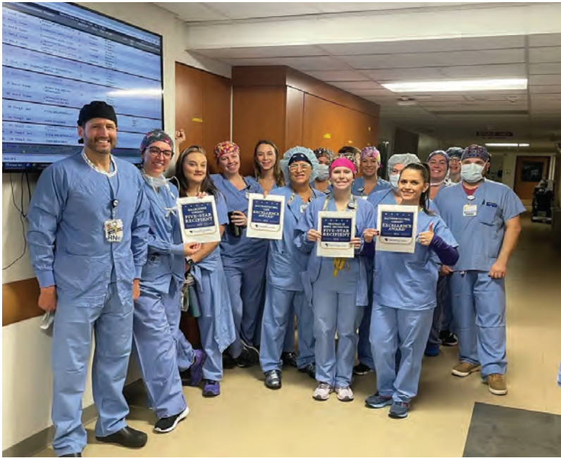
Above: Excellence in Gastro