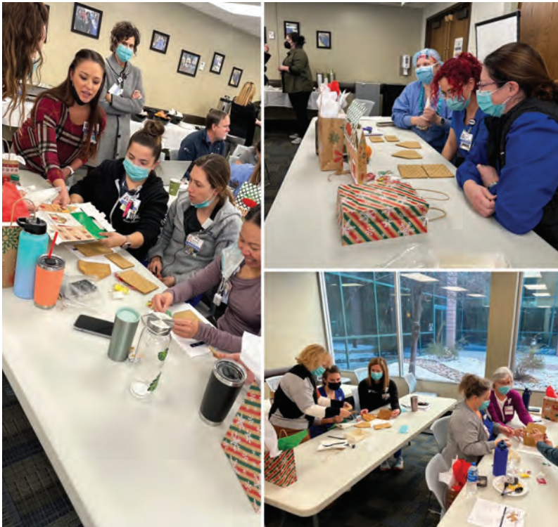
Below: Team building with the CNCs