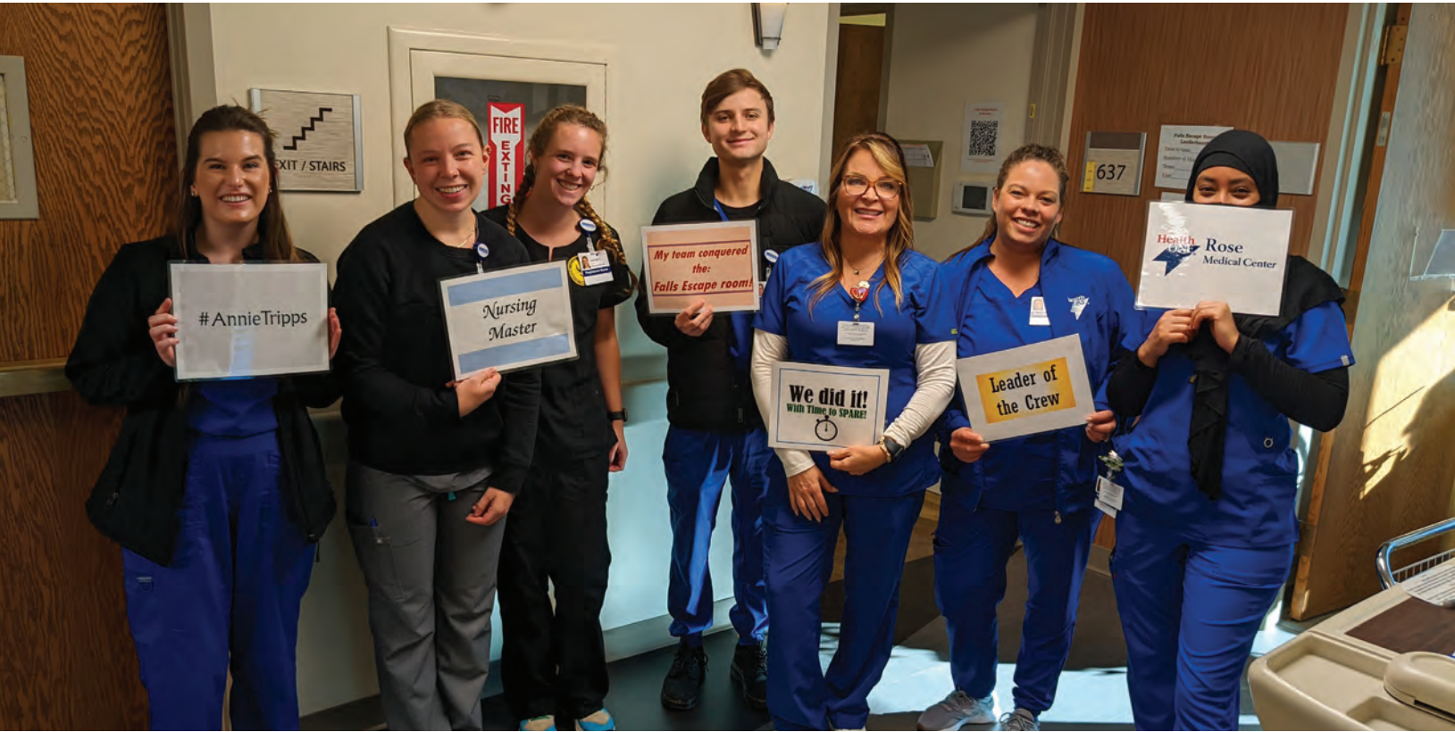
Above: StaRNs participated in the Rose Fall Escape Room

EDGE Program - Emergency Department Residency for Experienced & New Graduate Nurses: The EDGE Program is a paid, 5-month training program for registered nurses within HealthONE who want to transition to the Emergency Department (ED). EDGE Program 2022 Participants: