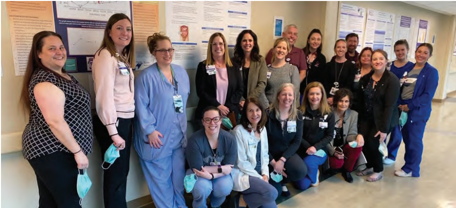
Above: Celebrating the Annual EBP Poster Fair