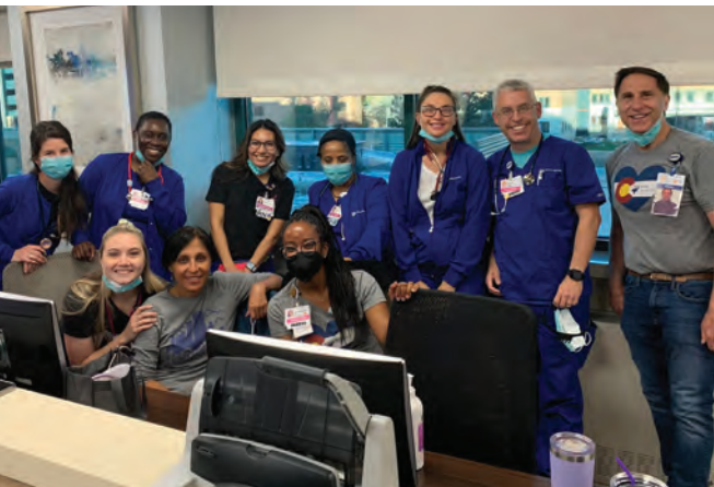
Above: 6 Central