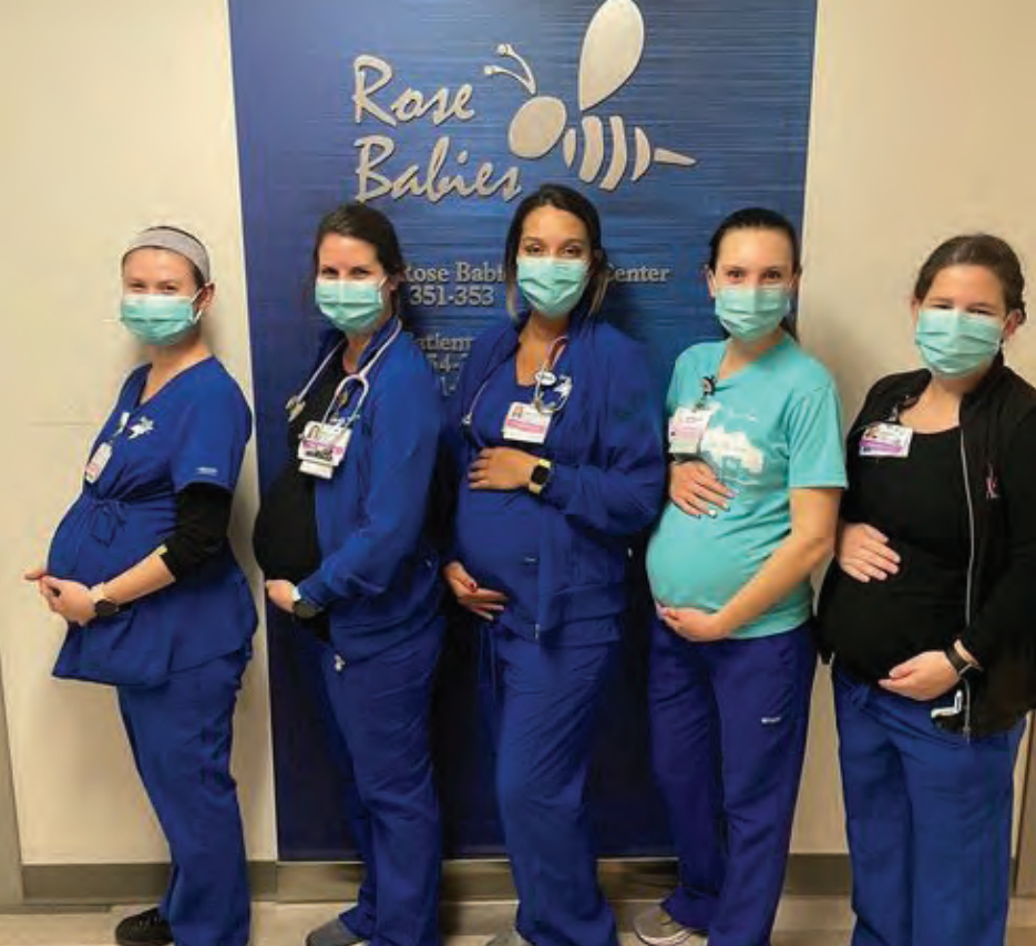
Above: Mom/Baby nurses who are soon to be moms with babies!