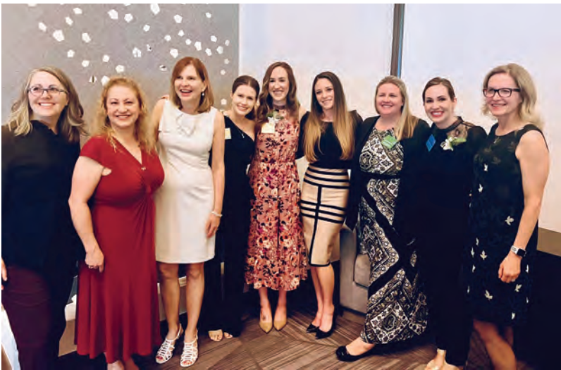
Celebrating our Nightingale nominated nurses