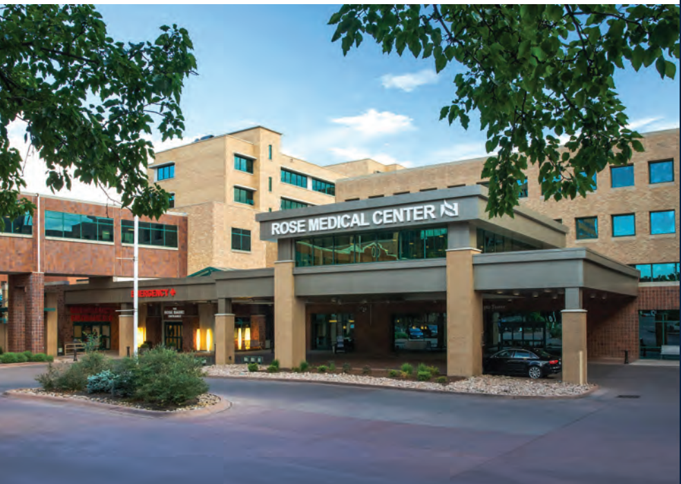
Below: Rose Medical Center

In addition, Rose’s quality is unmatched. Rose is one of 23 hospitals in the nation — and the only hospital in Colorado — to have received straight ‘A’ grades from the Leapfrog Hospital Safety Grade program since 2012 and Rose maintains a five-star rating from CMS’s prestigious Hospital Compare program.