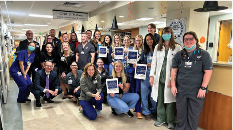
Above: 5 Stars for the ICU