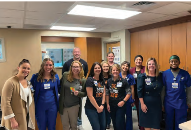
Above: Rose Medical Center Nurses