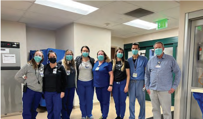
Above: Emergency Department