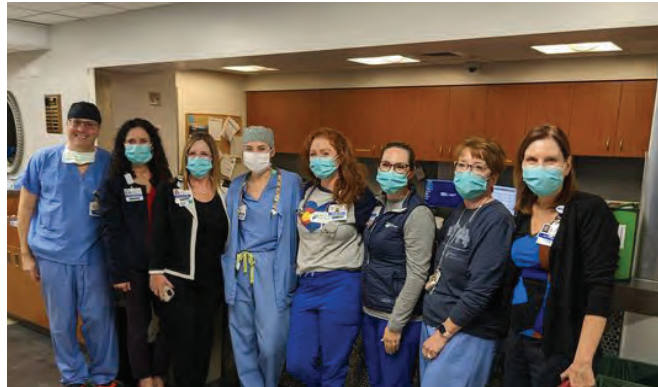
Above: Periop Nurses