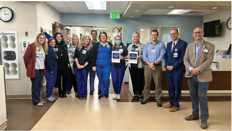
Above: ED Stroke Team